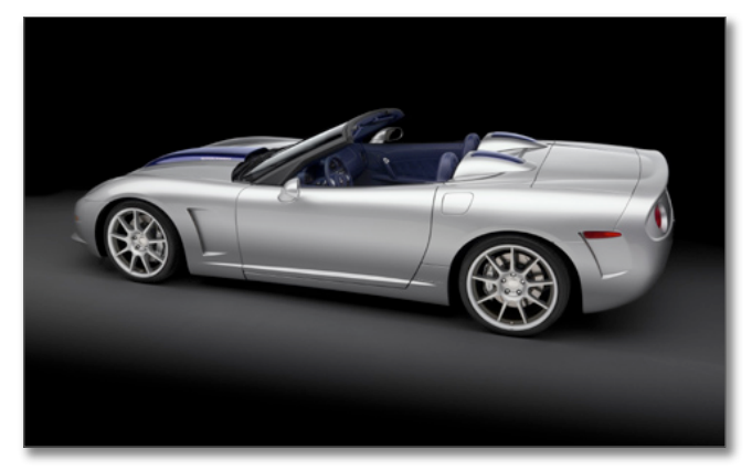
Callaway C16 Cabrio 650 hp